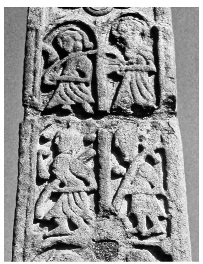
FIGURE 32 Sandbach Market Square 1C, Cheshire: the Road to Calvary

responsible for the production of carved stone sculpture in the region. Indeed, if it were not for the fragmentary scenes preserved on the single monument at Bakewell (34) and the seven to eight scenes (which did not include the Crucifixion), displayed at Wirksworth and the related fragments preserved at Bakewell (9 and 11, Ills. 28, 32), it might be thought that only the Crucifixion was deemed relevant for public display among those promoting sculptural art in the area. Nevertheless, even if the corpus of extant material was limited to presentations of this particular event, their iconographic significances demonstrate the various ways in which audience responses could be elicited. For, all three carvings of the Crucifixion seem to have included the symbols of the sun and moon in the upper spandrels of the cross, and featured Christ wearing a loincloth, while those at Bakewell and Bradbourne also show him accompanied by Longinus and Stephaton. However, unlike the Bradbourne scene, which is located at the base of the