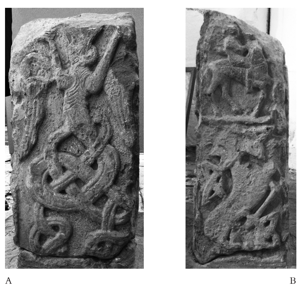
FIGURE 31a-b Breedon-on-the-Hill, Leicestershire: the Rider and Devil shaft

can be, and in this region of the west Midlands, do seem to have been used for symbolic ends, being combined to present iconographic programmes of considerably complex significance. In this respect, the carved relief panels of the monuments preserved in Derbyshire and Staffordshire have much in common with the icons of the early Church which favoured both portrait-type images as well as narrative schemes, such as the Annunciation and Crucifixion (see e.g. Nelson and Collins 2006).