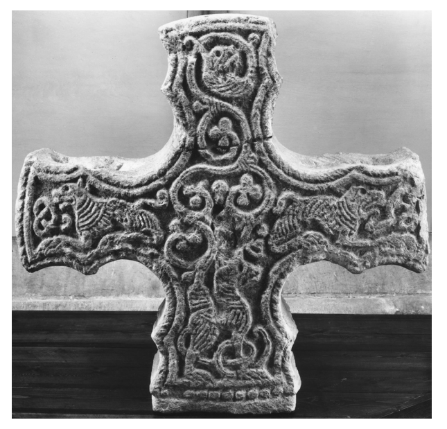
FIGURE 29a-b Cropthorne 1A and 1C, Worcestershire: animal types

3A, Ills. 442–3). On Bradbourne 1B, while the scrolls compare to those found on these monuments, they are arranged on either side of a central stem rather than the S-shaped single-stem arrangement (Ill. 111).